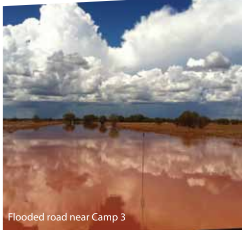
Flooded road near Camp 3