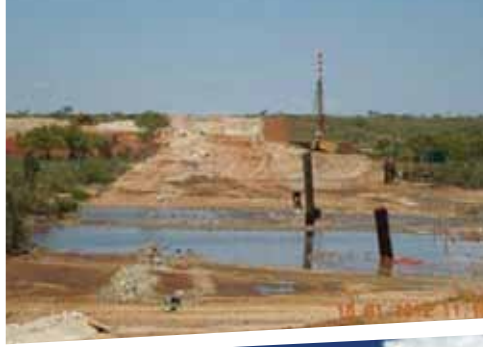
Coonarie Creek flooded during Cyclone Heidi

Cyclones are part and parcel of the Pilbara experience. With careful planning and rigorous safety precautions we all can thrive in spite of these dramatic shows of nature.