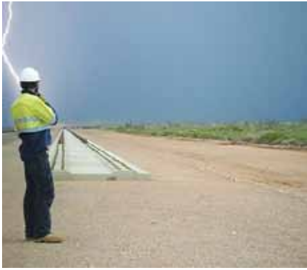
"I don't know why they call me lightning..."