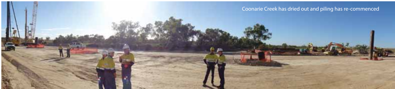
Coonarie Creek has dried out and piling has re-commenced